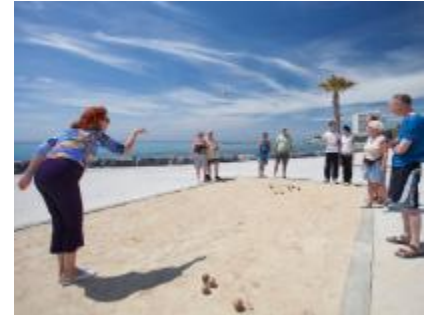
Petanca by the sea