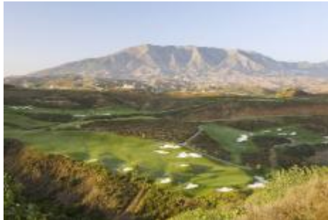
Play some golf