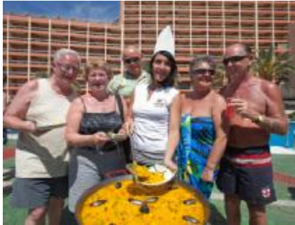
Learn to make paella