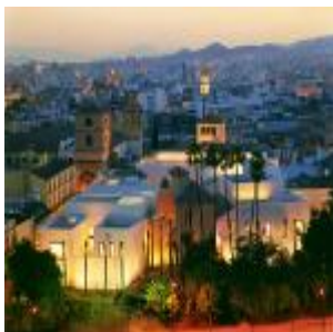
Picasso Museum, Málaga