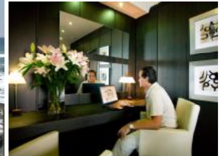
Keeping in touch