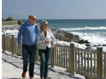
A stroll on the seafront