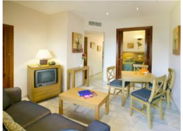
Twin bedroom separated from lounge by sliding doors