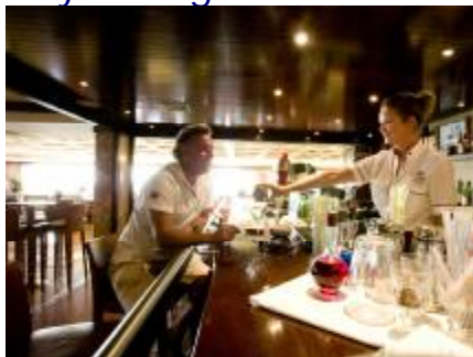
Daily Happy Hour