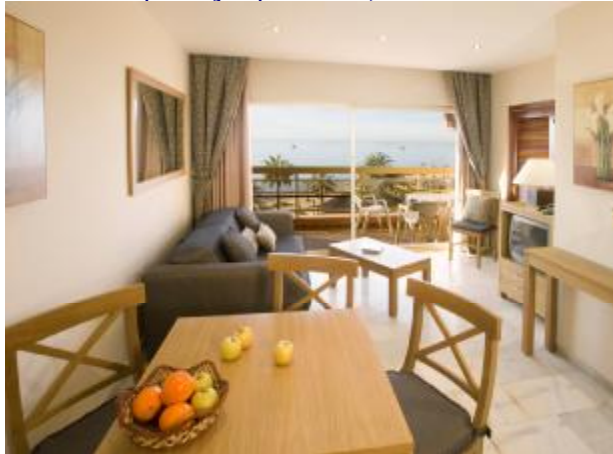
Sea view apartment

Max. occupancy 4 persons (recommended maximum adults = 3, i.e. one on double sofa bed)