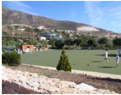
Bowling nearby (fee applies)