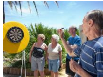
Darts by the pool