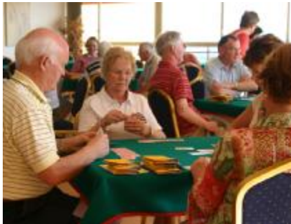
Bridge groups welcome