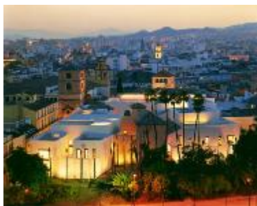
Picasso Museum, Málaga