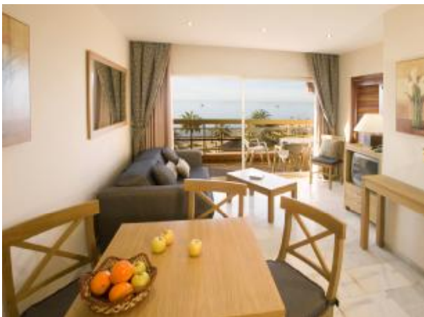
Sea view apartment

Max. occupancy 4 persons (recommended maximum adults = 3, i.e. one on double sofa bed)