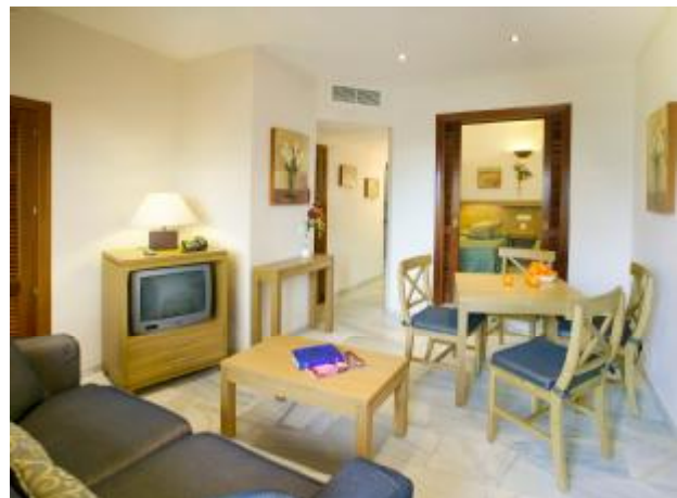
Twin bedroom separated from lounge by sliding doors